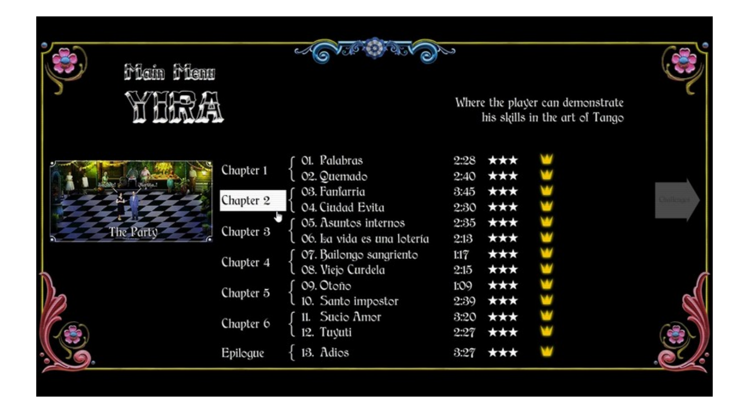
El Tango De La Muerte Activation Code [crack]

Download ->>->> <a href="http://bit.ly/2NJzoW4">http://bit.ly/2NJzoW4</a>